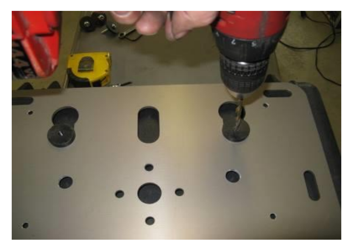
Step 15 With the ¼" drill bit, use the puck diagonally across from the master puck as a drill guide and drill a second pilot hole in the box.

Make sure the pucks are seated in the keyholes before drilling!!