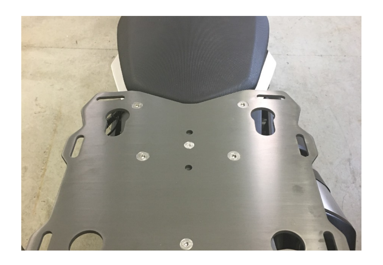
Step 3 Place the Slider plate on top of the spacers and install the longer bolts in the front and the shorter bolts in the rear. Tighten the rear bolts first, verify the bottom of the Slider plate sits flush on the top of the angled spacers. Repeat for the front screws.