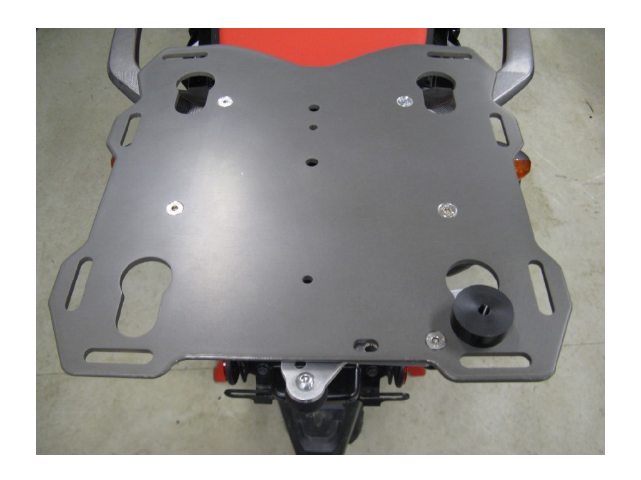
Step 6 Install one of the black plastic pucks into the key hole with the cam lever. Lock the puck into place with the cam lever. This will be referred to as the "Master Puck"

Note: Remove the large washer and screw from the puck before putting into the plate. The screws and washers are installed into the pucks for shipment as part of our QA process.