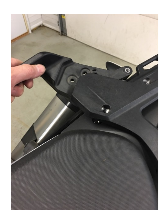
Step 1 Remove the OEM Top Plate and grab handles.