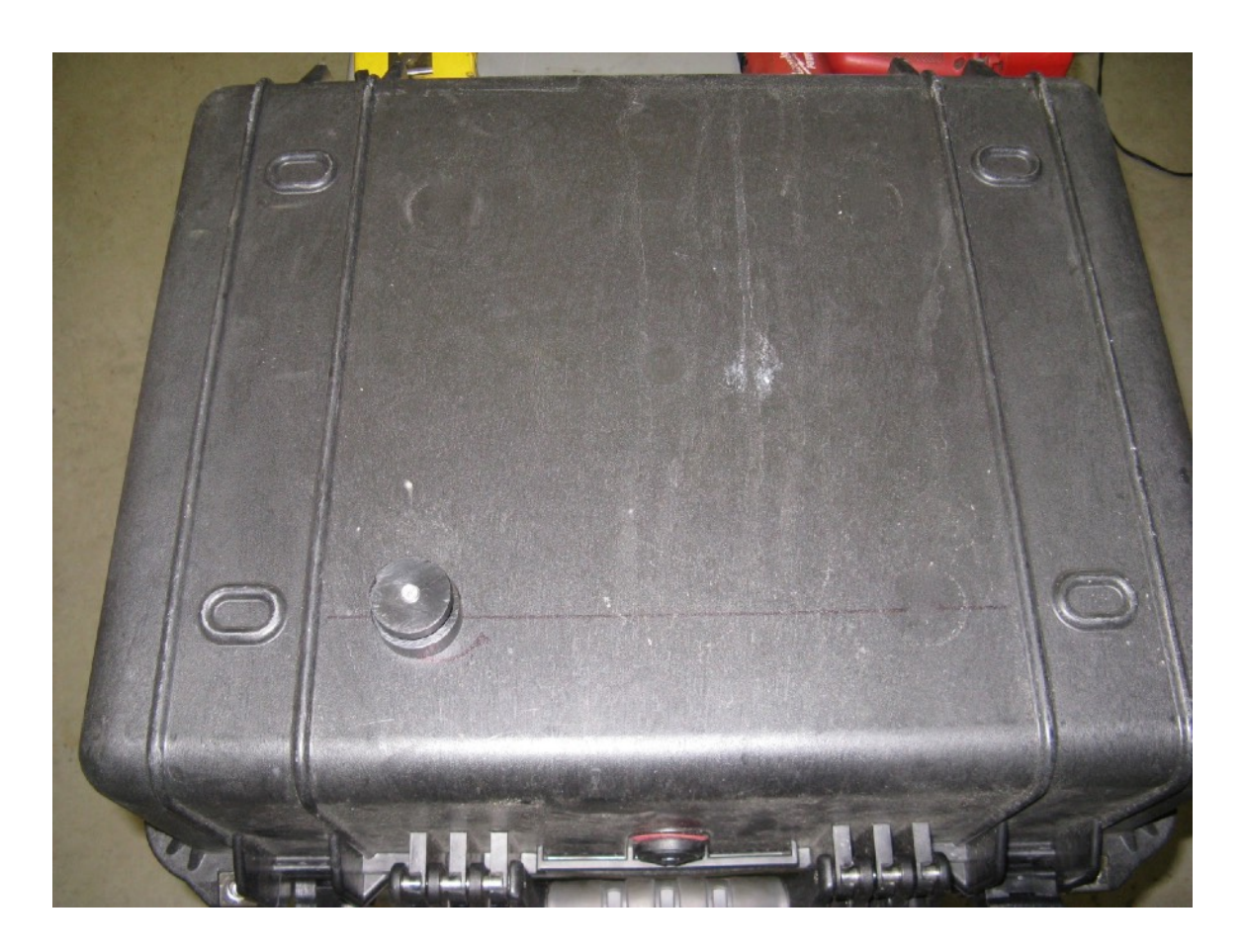
Step 13 Use the 5/16" button head cap screw and 1 ½" aluminum washer to attach the master puck to the box.