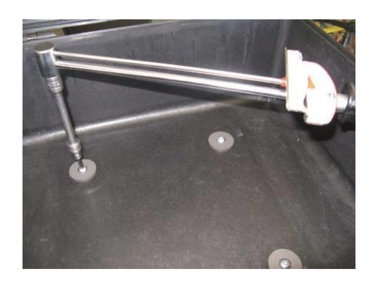
Step 22 Torque the puck screws to 108 in. lbs.