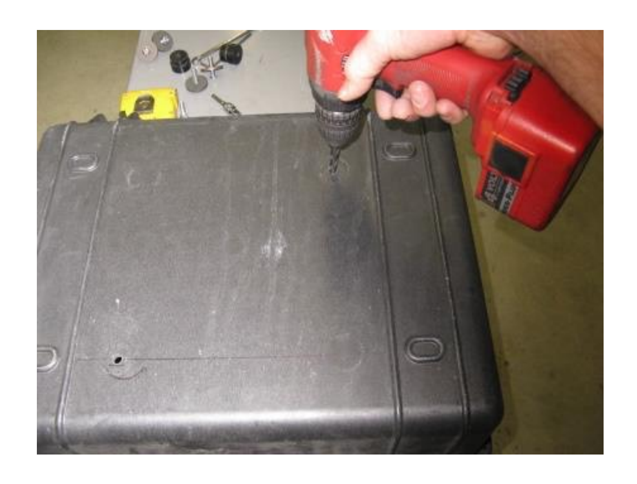
Step 16 Remove the rack from the box. Use the 21/64" drill bit and electric drill to enlarge the ¼" pilot hole