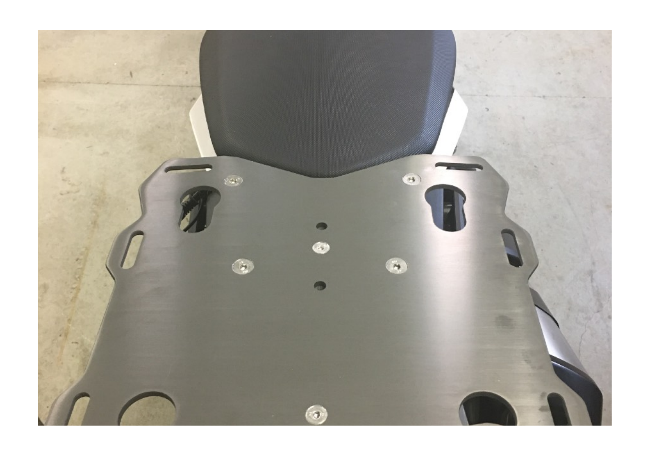
Step 20 Re-install the plate on the spacers. Re-install the M8 flat head screws and torque to 17 ftlbs.