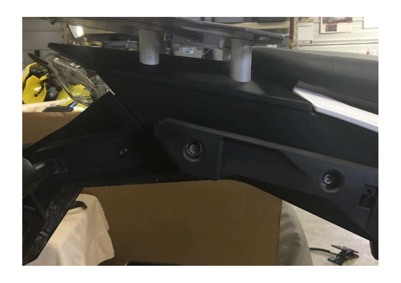
Step 4 Verify the Slider plate sits flush on the angled spacers.