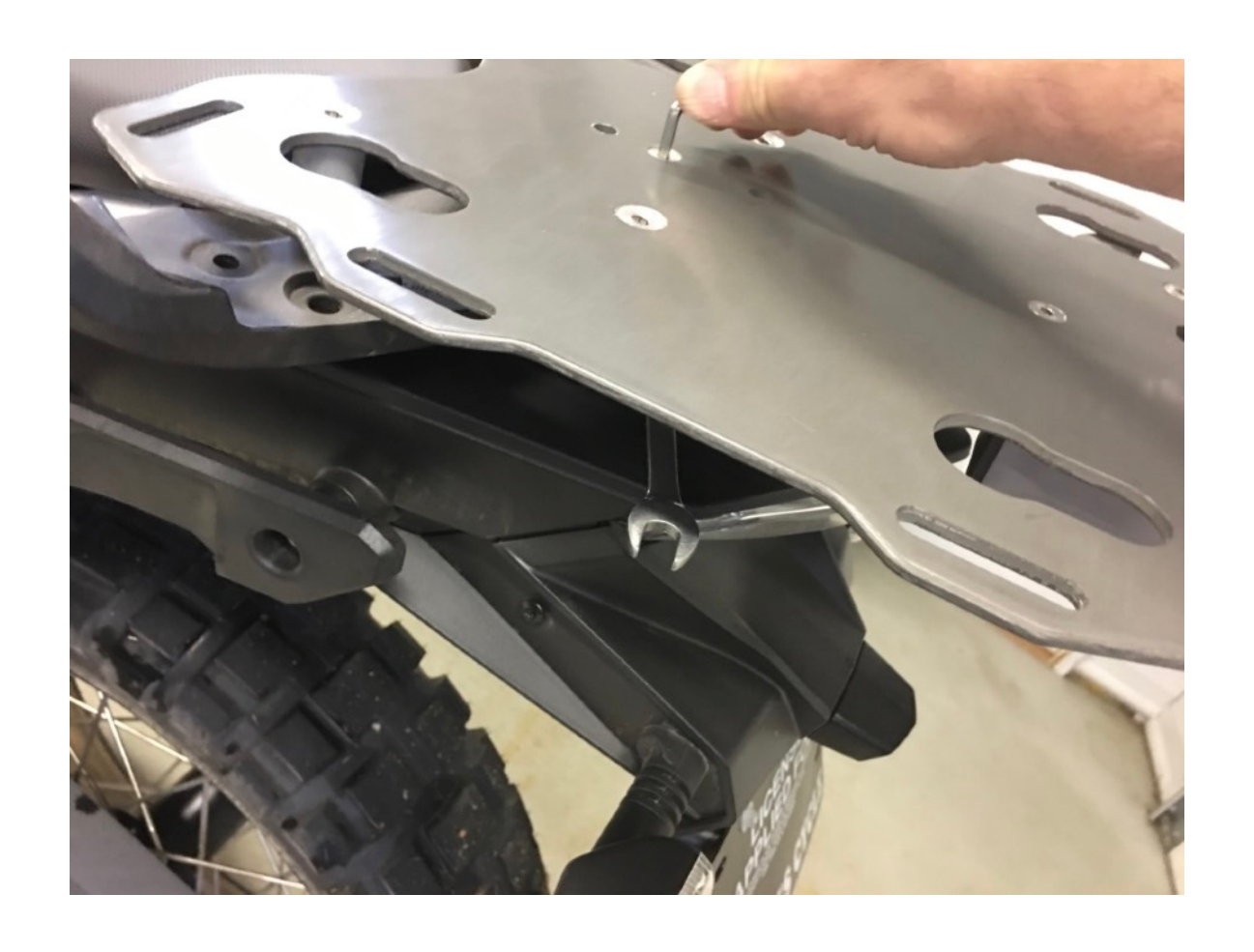
Step 5 Tighten the sub plate's two 6 mm screws and lock nuts using a hex key wrench and a 10mm combination wrench.