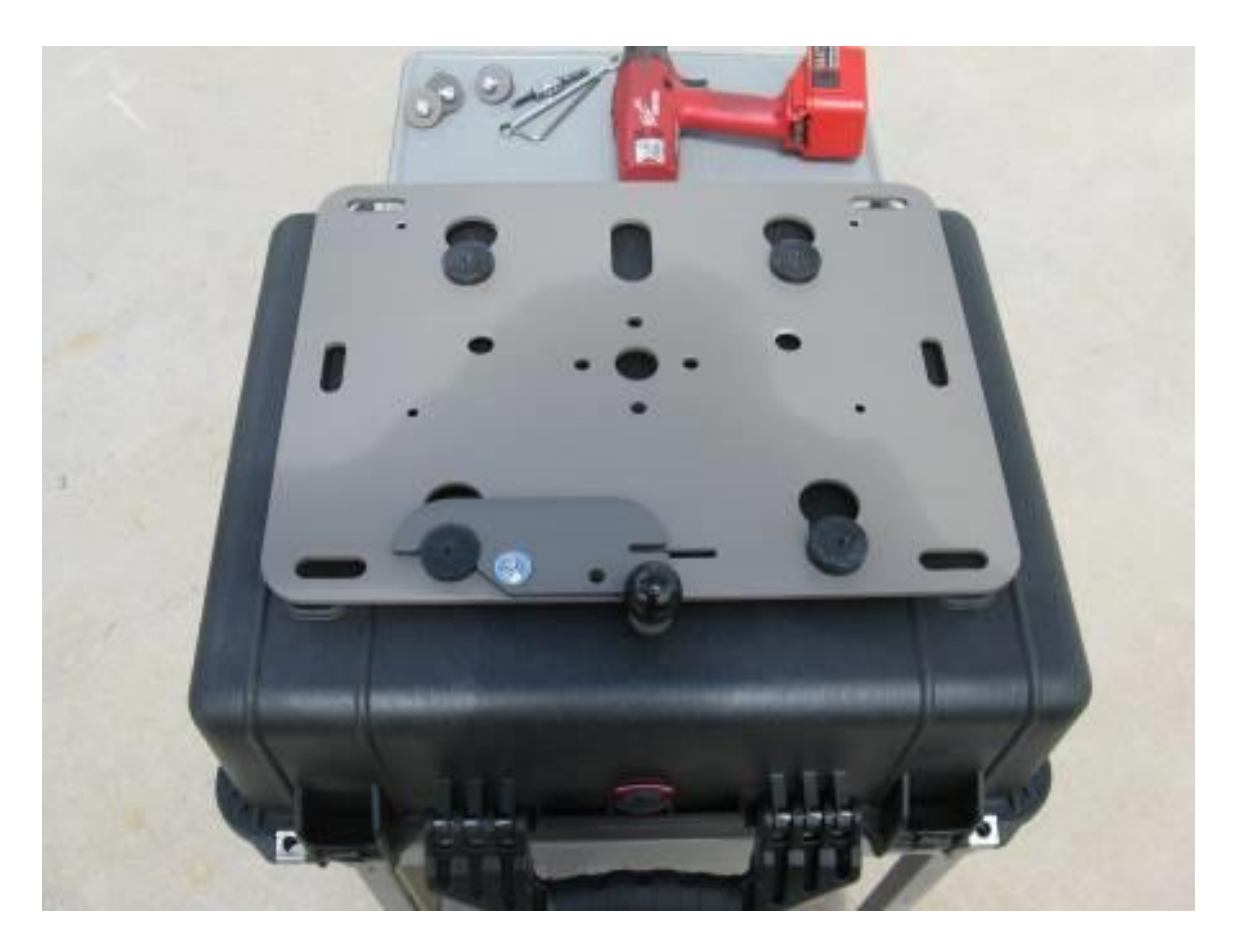
Step 9 Place the box on a table or other work surface. Remove the 4 flat head screws and nuts holding the rack onto the mounting brackets.

Place the rack on top of the bottom of the box.