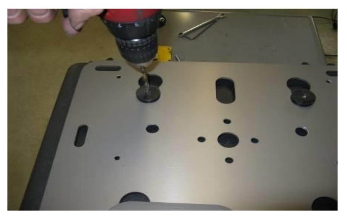
Step 17 Bolt the second puck to the box. Place the rack on the box and latch it into position. With the ¼" drill bit use the 2 remaining pucks as drill guides and drill the last 2 pilot holes.

Make sure the pucks are seated in the keyholes before drilling!!