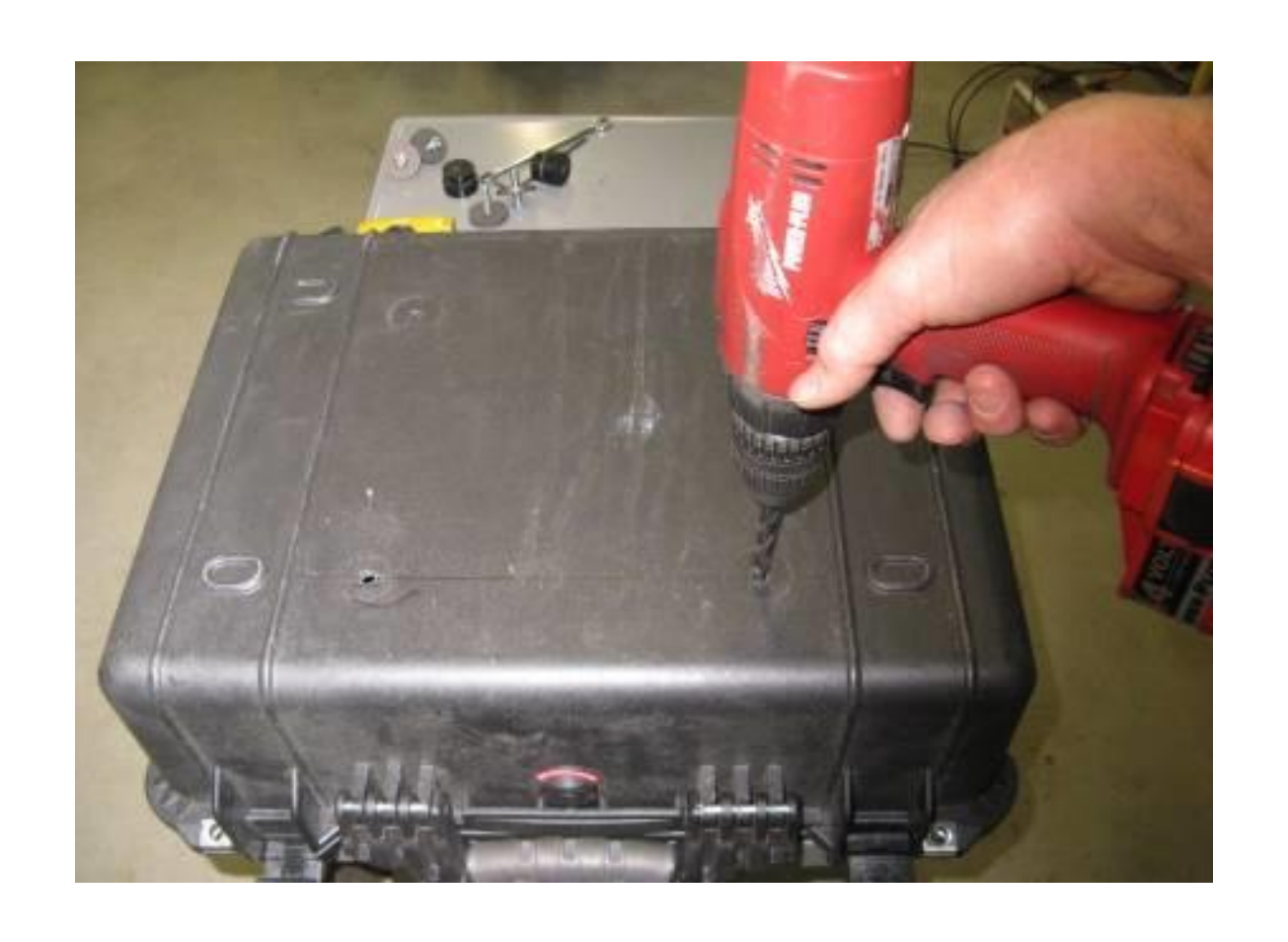
Step 18 Remove the rack and pucks from the box. Use the 21/64" drill bit and electric drill to enlarge the last 2 1/4" pilot holes.