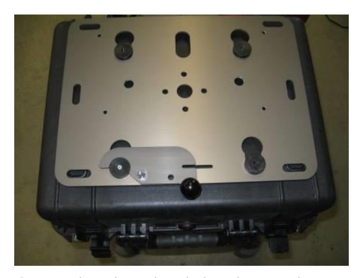
Step 14 Place the rack with the other 3 pucks onto the master puck and latch it into position. Square up the plate and box to each other (last chance).