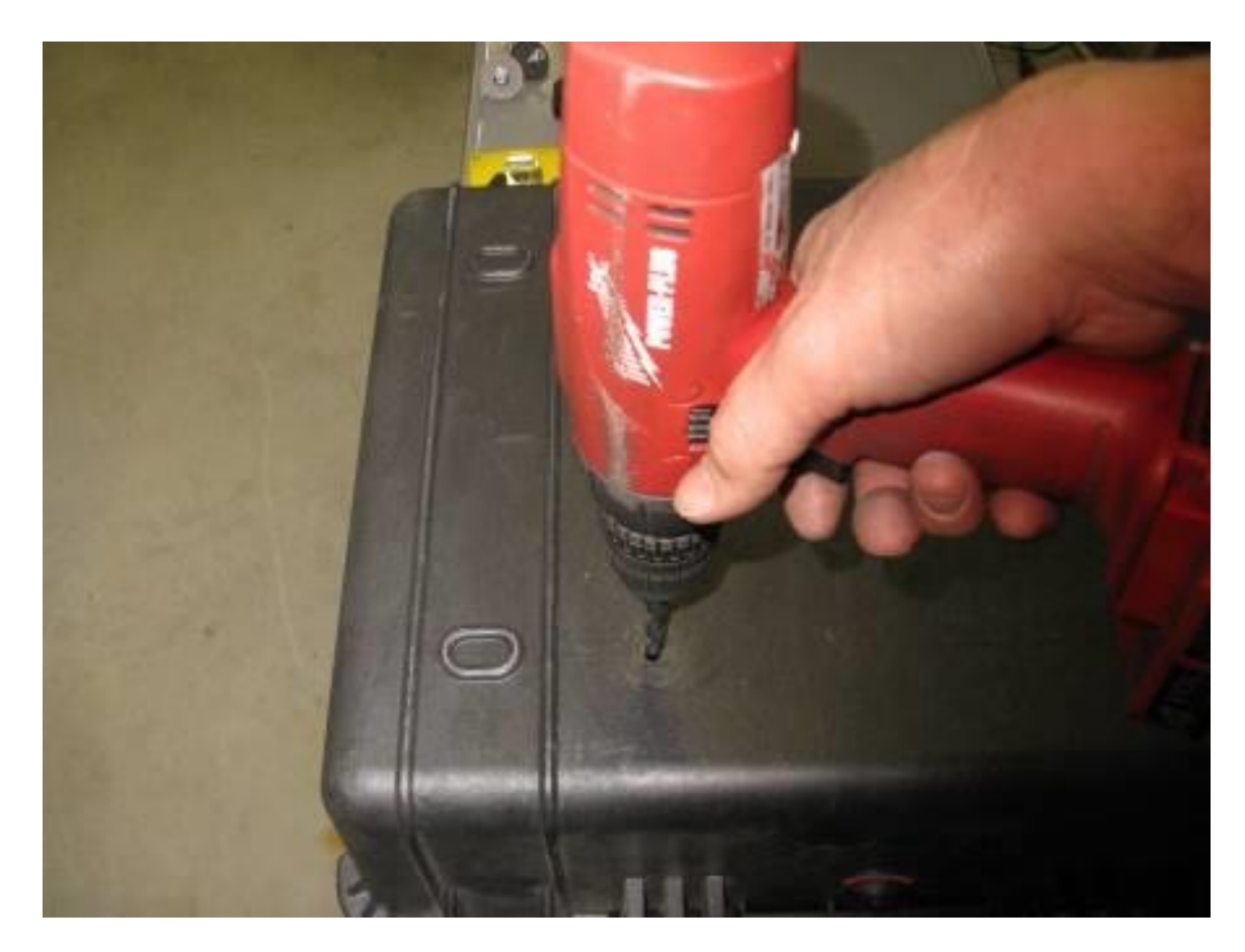
Step 12 Remove the rack from the box. Use the 21/64" drill bit and electric drill to enlarge the 1/4" pilot hole