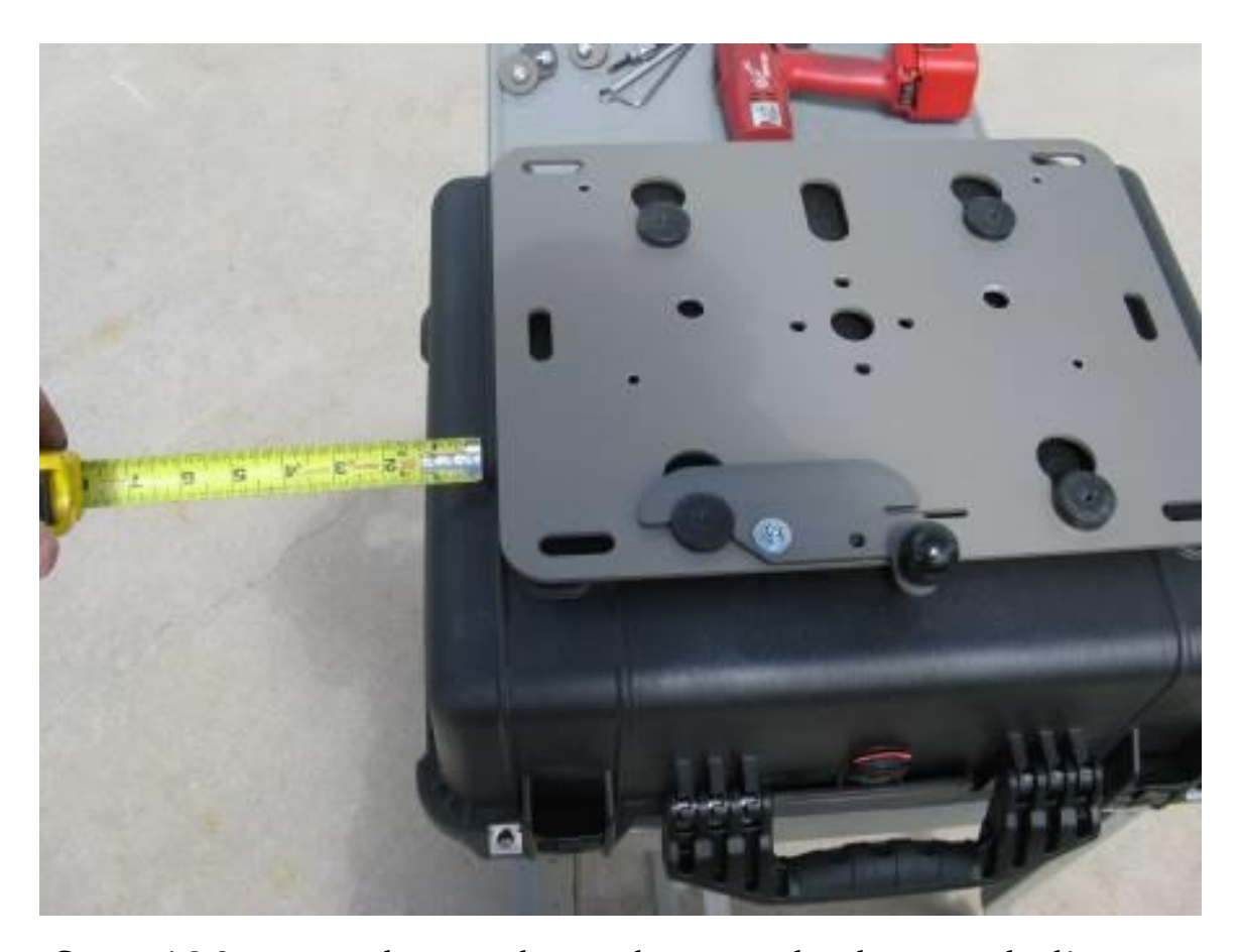
Step 10 Locate the puck marker on the box and align the master puck up with the mark as it was on the bike.

Adjust the box side to side and make any final adjustments to the location.