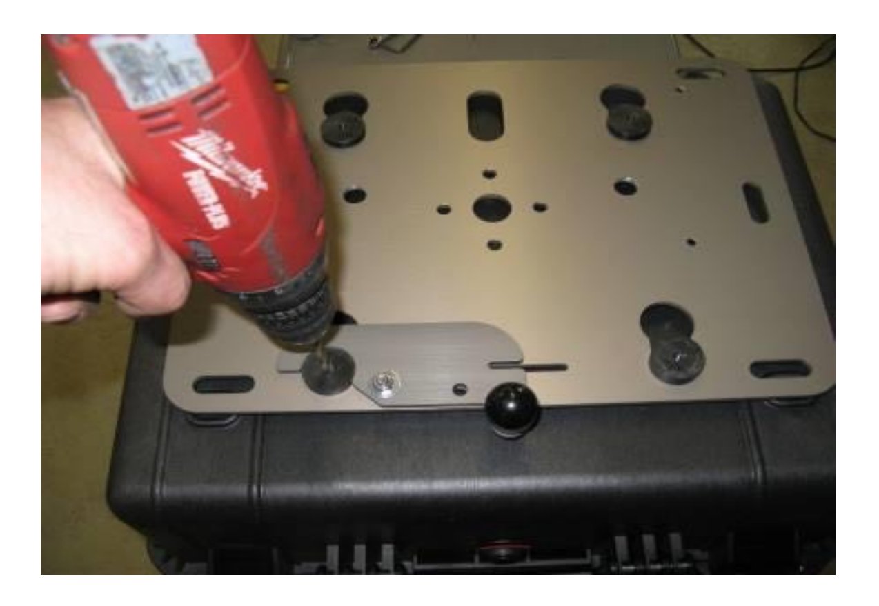
Step 11 Make certain the plate is positioned on the box where you would like it. A helping hand would be useful during the next few steps but it can be done solo.

With a ¼" drill bit and electric drill use the master puck as a drill guide and drill a pilot hole through the box.