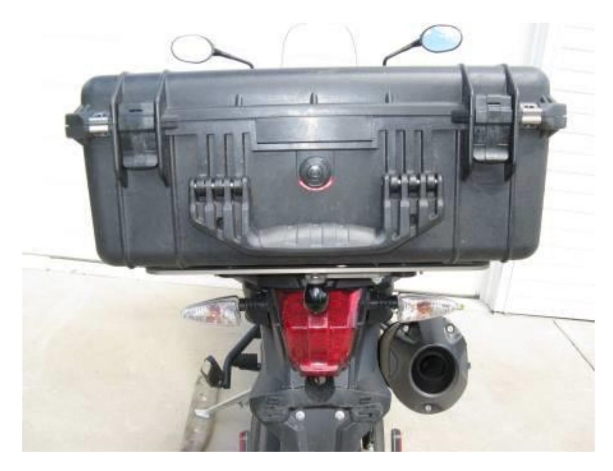
Step 21 Install the box onto rack and latch it into place with the cam lever.