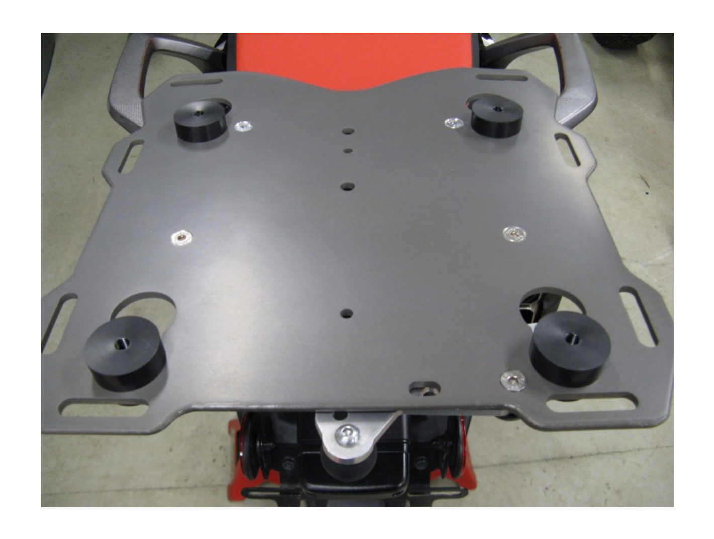
Step 7 Insert the 3 remaining pucks into the keyholes in the plate.